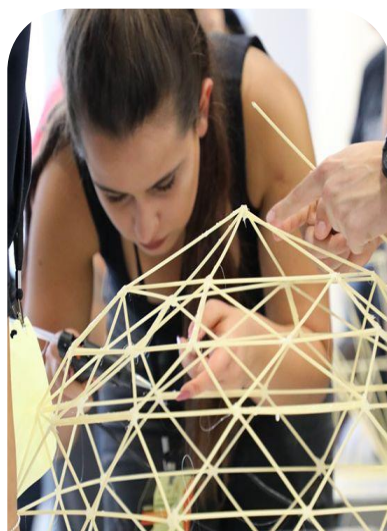
Construction of Buildings and Facilities