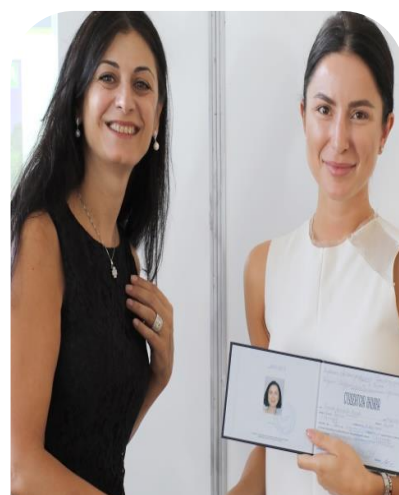
Business Administration and Management