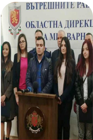
Counteraction to Crime and Public Order Protection